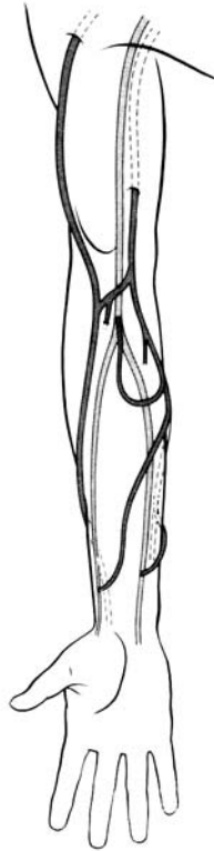
Figure 1. The three possibilities of performing an A-V fistula with the basilic vein of the forearm

Transposition of the basilic vein into a subcutaneous loop, with an end of vein to side of brachial artery anastomosis The group of Kinnaert had a patency rate of two out of three functioning fistulae at two years [6].