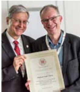
FERA (Fellow of the European Renal Association) →