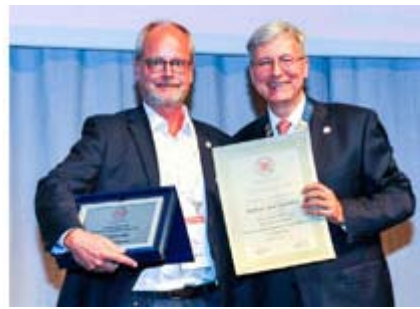
2018 Awards & Award Committee →