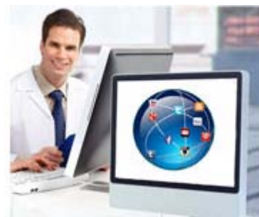
ERA-EDTA Social Media & Communication → (Website Committee, Press, Follow Us & ERA-EDTA Flash)