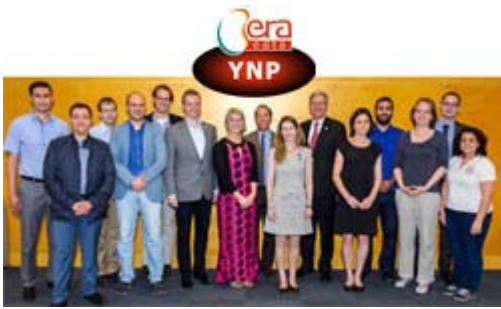
YNP (Young Nephrologists' Platform)→