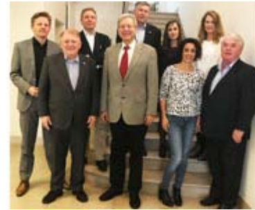
ERA-EDTA & European Community (EKHA - European Kidney Health Alliance) →