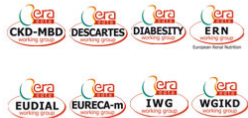
ERA-EDTA Working Groups → (and Endorsed WGs)