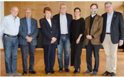
ERA-EDTA Ethics Committee →