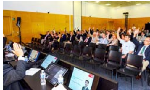
Agenda of the ERA-EDTA 55th General Assembly →

Members only can access this file using their credentials