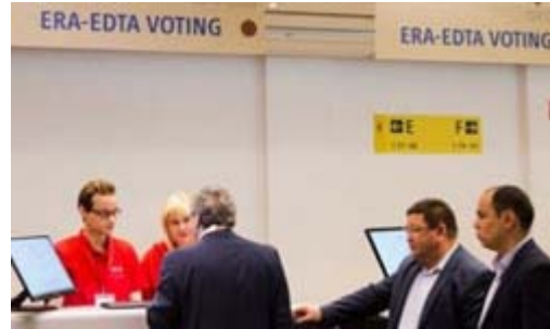
Election of Ordinary Council Members 2018 →