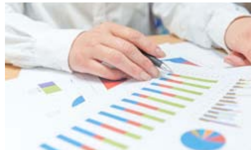
Provisional Accounts 2017 →

Members only can access this file using their credentials