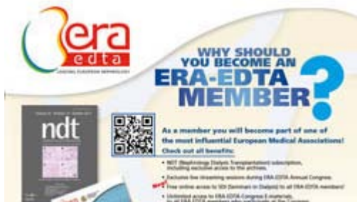
ERA-EDTA Membership →