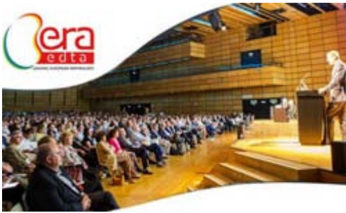
ERA-EDTA Endorsements →