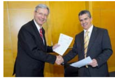
Collaboration with other Societies →