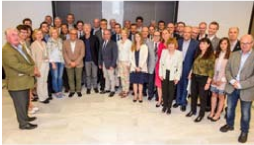
Collaboration with National Societies of Nephrology →