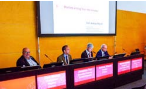
Minutes of the 54th General Assembly (Madrid, Spain) →

Members only can access this file using their credentials