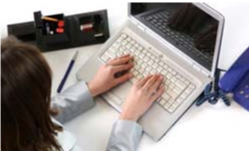
ERA-EDTA Accounts 2016 →

Members only can access this file using their credentials