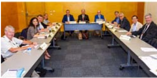
SAB (Scientific Advisory Board) Activity→ (Research, Young Fellowship Programme, ComIA)