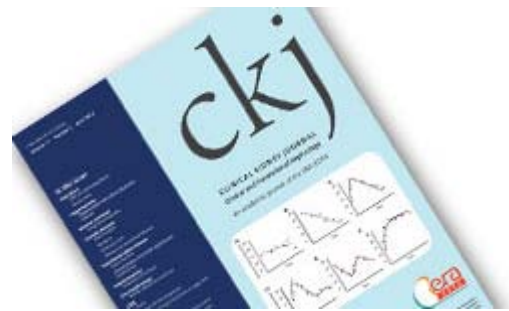
ckj (Clinical Kidney journal)→