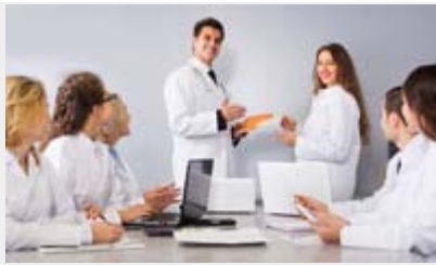
ERA-EDTA CME Activity →