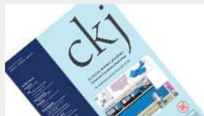
ckj (Clinical Kidney Journal) →