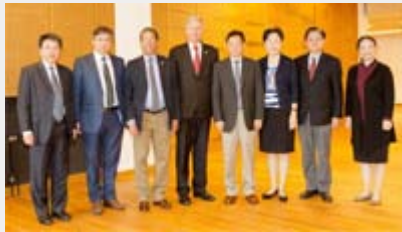
Collaboration with other Societies →