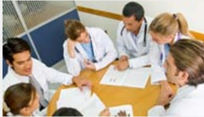
SAB (Scientific Advisory Board) Activity → (Research and Fellowship Programs)