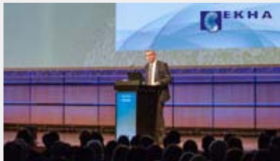
ERA-EDTA & European Community (EKHA - European Kidney Health Alliance) →