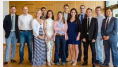
YNP (Young Nephrologists' Platform) →