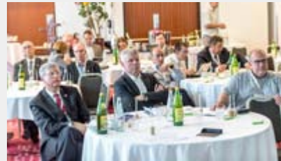
Collaboration with National Societies of Nephrology →